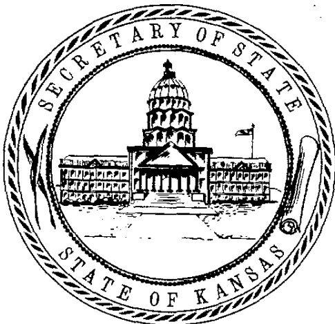
RON THORNBURGH SECRETARY OF STATE

In testimony whereof: I hereto set my hand and cause to be affixed my official seal. Done at the City of Topeka, this 11th day of December, A.D. 2002