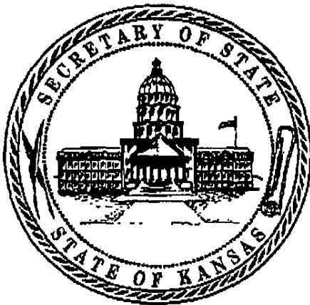
RON THORNBURGH SECRETARY OF STATE

In testimony whereof: I hereto set my hand and cause to be affixed my official seal. Done at the City of Topeka, this 20 th day of January, A.D. 2010