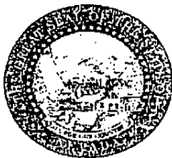
DEAN HELLER Secretary of State

Electronic Certificate Certificate Number: C20061223-0045 You may verify this electronic certificate online at http://secretarvofstate.biz/