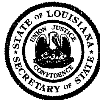
Secretary of State 34703932D