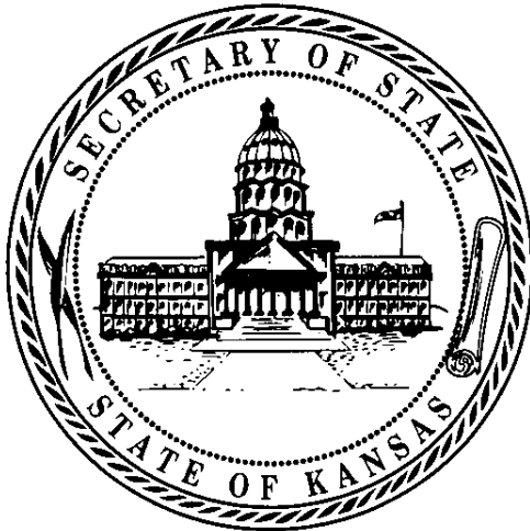
RON THORNBURGH SECRETARY OF STATE

In testimony whereof: I hereto set my hand and cause to be affixed my official seal. Done at the City of Topeka, this 16th day of October, A.D. 2009