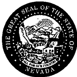
ROSS MILLER Secretary of State

Electronic Certificate Certificate Number: C20110427-1292 You may verify this electronic certificate online at http://www.nvsos.gov/