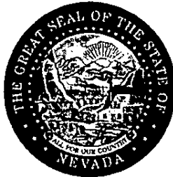
Ross Miller ROSS MILLER Secretary of State

IN WITNESS WHEREOF, I have hereunto set my hand and affixed the Great Seal of State, at my office on October 8, 2014.