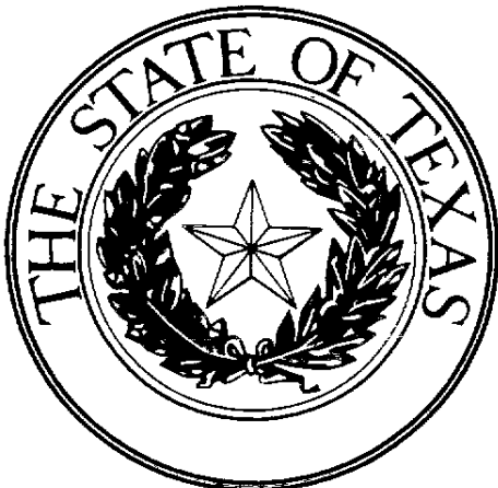
Alberto R. Gonzales Secretary of State

IN TESTIMONY WHEREOF, I have hereunto signed my name officially and caused to be impressed hereon the Seal of State at my office in the City of Austin, on February 20, 1998.