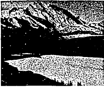
Sunrise, Mt. McKinley